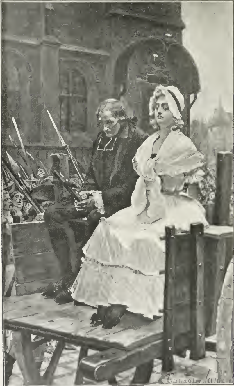
MARIE ANTOINETTE ON HER WAY TO EXECUTION.